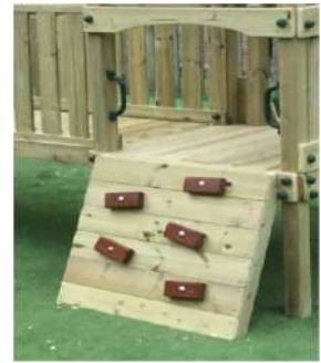
Wonky chock wall