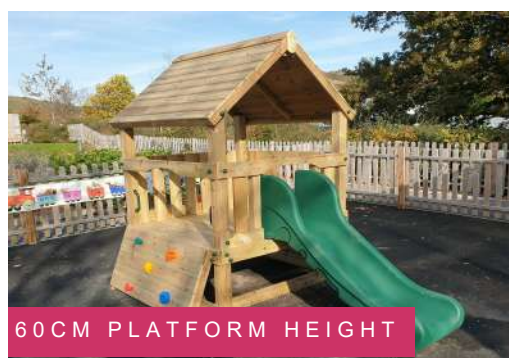
60CM PLATFORM HEIGHT