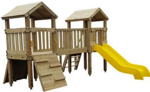
Double Toddler tower 90cm PH