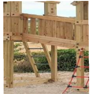
Fixed wooden bridge