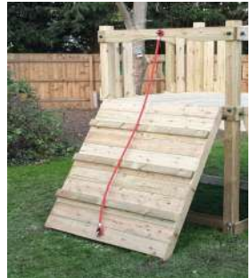
Ramp with rope