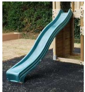
HDPE slide 3+ years

CUSTOMISE YOUR CLIMBING FRAME More accessories are also available