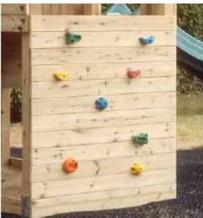
Vertical rock wall