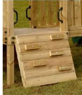
Straight chock wall