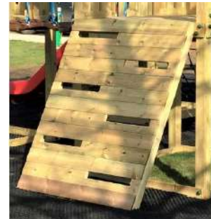
Open left right climber