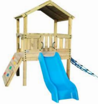
Single Toddler tower 90cm PH