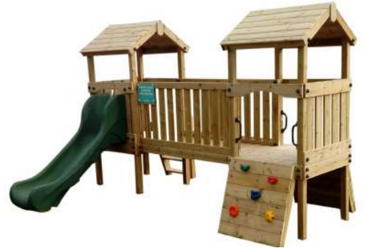
Double Toddler tower 60cm PH