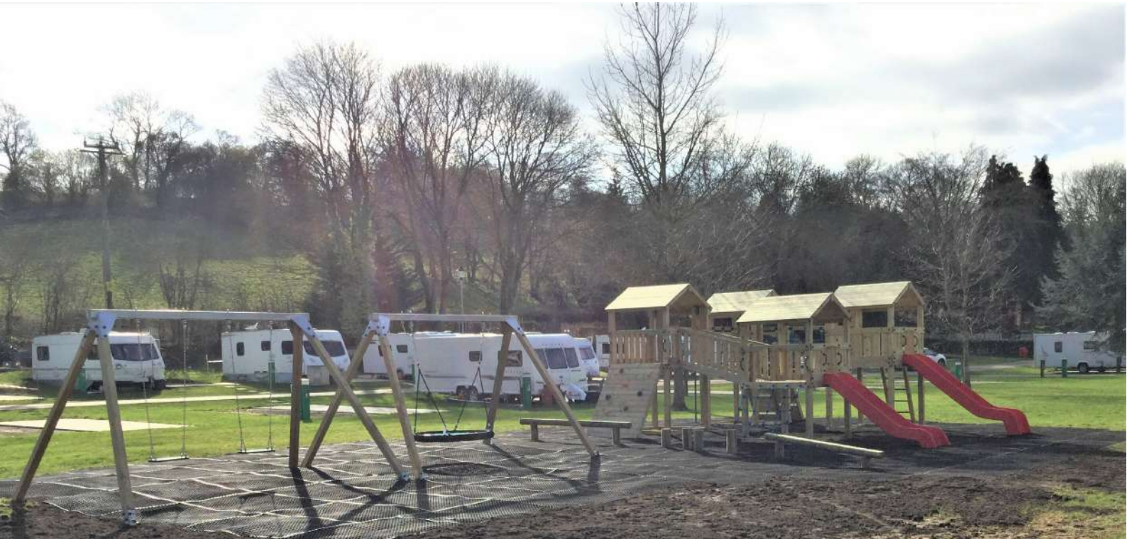
Maguire Caravan Park, Monmouth