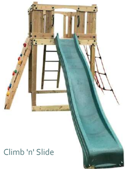
Climb 'n' Slide