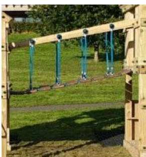
Recycled timber Clatter Bridge