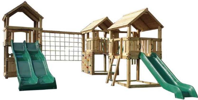
Bespoke Climbing Frame