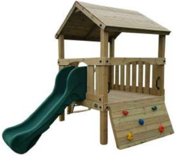
Single toddler tower 60cm PH