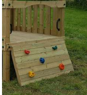
Angled climbing wall