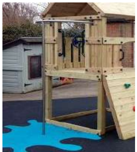
Fireman's pole stainless steel